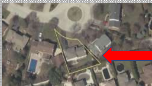
Large Pie Shaped Lot