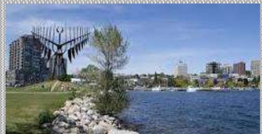
Enjoy Barrie's beautiful Lake Simcoe